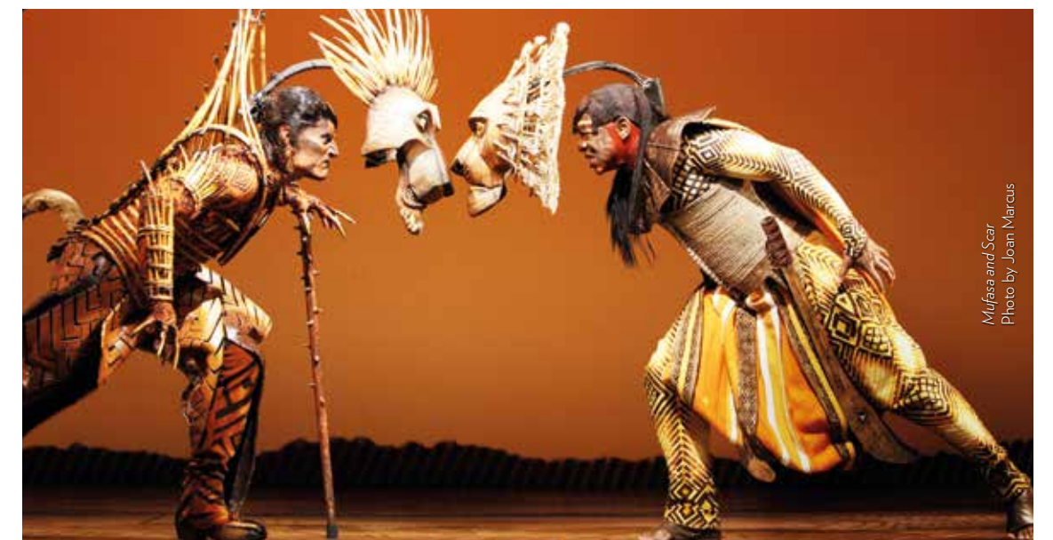
Mufasa and Scar

Discover the magic of Spectra and experience a captivating light and water display like no other. A reflection of Singapore's journey as a multicultural society into the cosmopolitan city she is today, this 15-minute visual spectacular is shown free nightly at the Event Plaza.